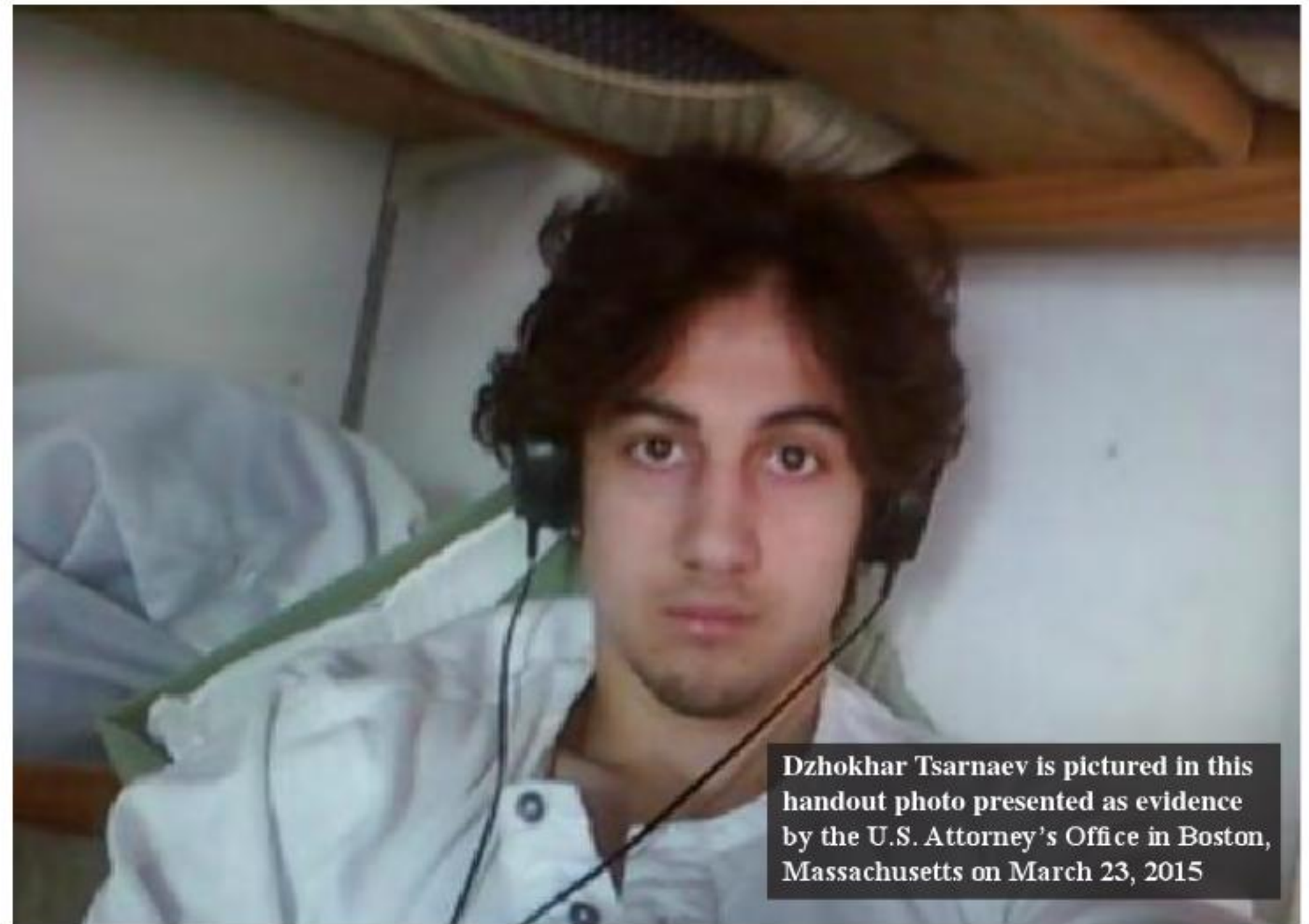
Dzhokhar Tsarnaev is pictured in this handout photo presented as evidence by the U.S. Attorney's Office in Boston, Massachusetts on March 23, 2015

Tamerlan Tsarnaev died on April 19, 2013, following a gunfight with police